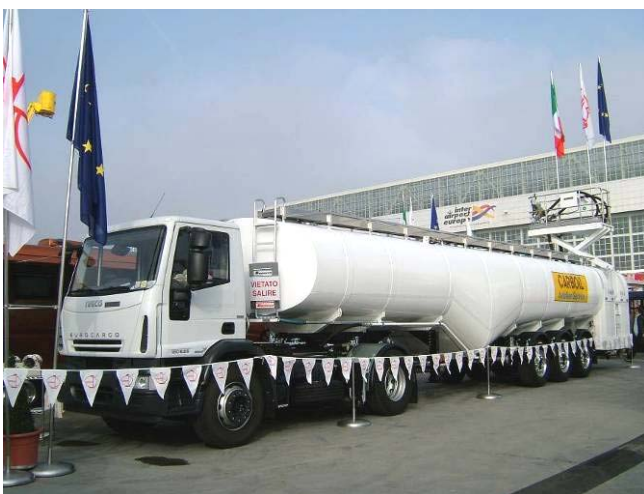
Aircraft refueller with capacity of 40000 litres, refuelling unit on rear side with elevating platform, flow rate up to 2500 lpm